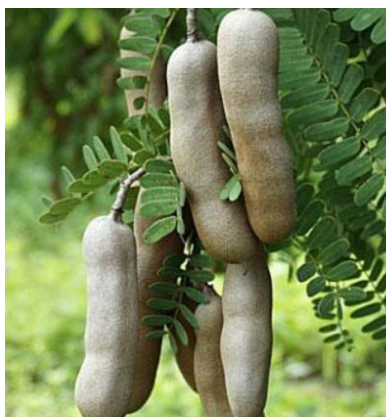
Figure 1 — Photograph of green tamarind fruit