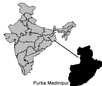
Fig. 1 —The black coloured region is Purba Medinipur, a district in the south of West Bengal state, India. The latitude and longitude coordinates are 21.9373° N, 87.7763° E, respectively. [Disclaimer: only for education purpose].

Likewise graphic or interior design in any other product, food design is also very important for