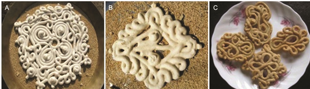
Fig. 2 — Sun-dried ornament shaped product, Gahana bori

exploring or attracting the consumer. Ethnic food design depends upon personal art based on deliberate and reasoned shaping and making of food in ways that satisfy our needs and give meaning to our lives. In the present treaties, rural women prepared a lentil dumpling, shaped like their occasional festive ornaments. This fermented food, locally called Gahana (ornament) bori (Fig. 2), has a significant impact on local food culture as it can protect their food heritage and pass on traditional and local wisdom on how to prepare and cook such products.