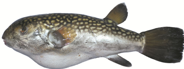
Fig. 2 — Chelonodontops bengalensis , 301 mm SL, fresh, Bahabalpur (Kasafal South) landing centre, Odisha, India, drift gill net, 18–22 m depth, 3 Aug 2018

Length (%SL). One specimen was preserved in 10 % formalin and deposited in the Marine Biodiversity Referral Museum of ICAR-Central Marine Fisheries Research Institute (CMFRI), Cochin, Kerala, India under the Accession Number GB 43.6.7.1 for future reference.