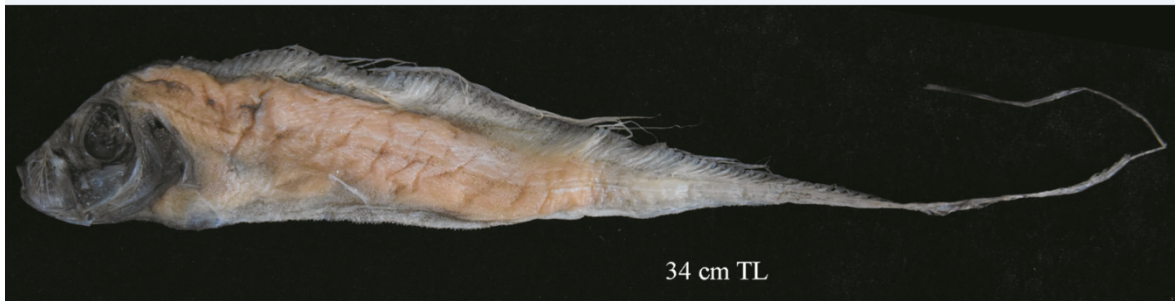
Fig. 2 — IO/SS/FIS/00527, Desmodema polystictum , 34 cm TL

Holotype : Trachipterus deltoideus Clark 1938: 180; Rurutu Island, “Australis” (Tubuai Islands); holotype, California Academy of Sciences (CAS 5532). Current status, synonym of Desmodema polystictum (Ogilby, 1898).