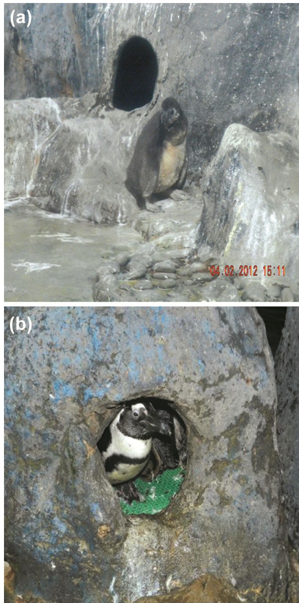
Fig. 4 — Photographs showing (a) Chick, and (b) Nest

So, it is essential to differentiate between the eggs. Candling an egg is a method that can help us get a glimpse of the egg by shining a concentrated light beam through the egg 7,8 . It is beneficial to observe embryo development around seven days before candling can be started. The embryo is appeared as a dark spot surrounded by a faint outline of blood vessels, and it becomes more prominent as incubation progresses 35 . As the eggs develop, the air cell (located at the fat end of the egg) is enlarged and eventually tilts. The air cell can be observed upon candling 36 . By drawing the edges of the air cell on the outside shell, the staff can predict their hatching time. The chick