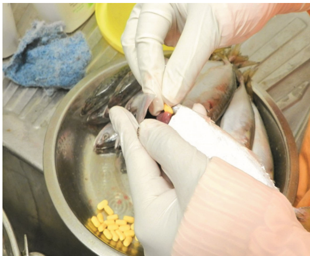
Fig. 3 — The Mazuri fish eater food tablets that were inserted into the fish gill

UWL was sardine, with 20,940 g. For the same year, UWL provided an average of 17,022.75 g of food per month, with the highest amount recorded in June ( i.e. , 19,440 g) and the lowest amount recorded in January ( i.e. , 11,730 g).