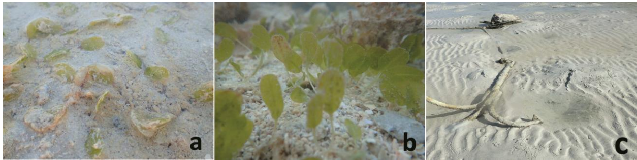
Fig. 2 — H. ovalis patches at highly anchored site 1 (a), sheltered site 2 (b), and type of anchors used (c)