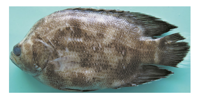
Fig. 2 — Formalin preserved specimen of L. surinamensis (TNJFU-MF-07), 97.2 mm SL collected from Pulicat lagoon