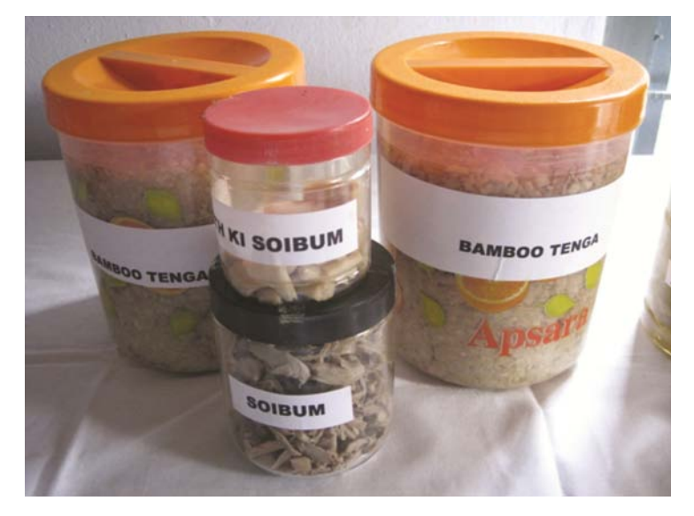
Plate 2 — Ethnic fermented products from tender Bamboo shoots in Arunachal Pradesh<sup>12,129</sup>

Soibum and Soidon are the most popular fermented product prepared from inner white portion of tender bamboo shoots and is consumed in North Eastern India, especially in Manipur<sup>29,38,39</sup>. The shoots of Dendrocalamus hamiltonii , D. sikkimensis, Bambusa tulda, B. balcooa are commonly used. The tender bamboo shoots of are cut in to strips after removing the outer green colour sheaths and fermented for a week after boiling to prepare products called Tenga , and Lung-siej , which are most common ethnic food of Meghalaya<sup>113-115</sup>. Lung-siej contain high fat, iron, and magnesium levels (0.6 mg, 8.5 mg/100 g, and 294mg/100g, respectively) on fresh weight basis. Ekung , a popular fermented product of Nishi tribes of Arunachal Pradesh is mostly prepared from tender shoots of Dendrocalamus hamiltonii , D. giganteus ,