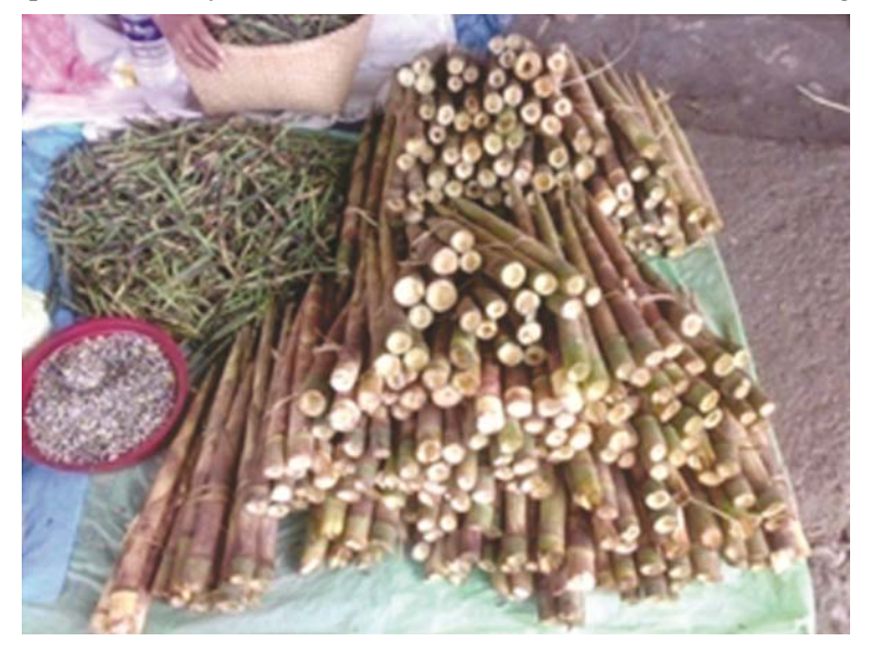
Plate 1 — Road side selling of fresh bamboo shoots in Imphal, Manipur

Tender, immature, and young stalks emerging from the nodes of the pseudo rhizome is called bamboo shoot. It grows to a length of 20-30 cm tapering towards tip giving a conical shape. Each shoot weighs more than 1 kg at the time of harvesting<sup>27</sup> (Plate 1). However, their size and weight depend considerably