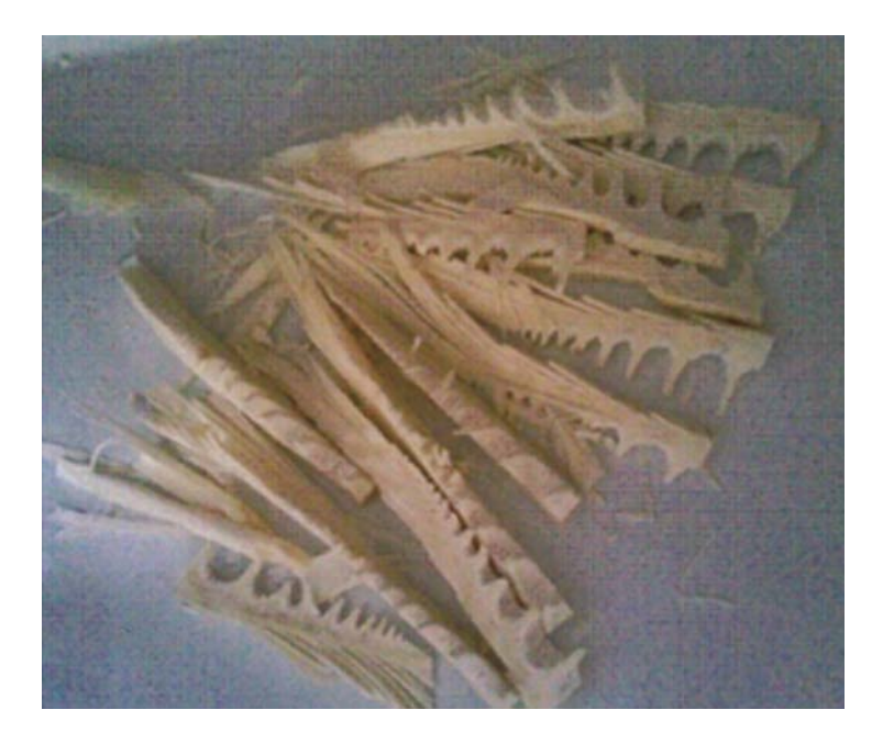
Plate 3 — Bamboo shoot prepared for sun drying<sup>54,97</sup>

down from 92 to 5 % per 100 g weight<sup>119</sup>. In recent times, bamboo shoot is blanched after slicing into small pieces in hot water to reduce its enzymatic activity and is treated with KMS (1 %) for 10 min. Then it is sun dried or cabinet dried and packed in an air tight container<sup>113,119</sup>. Osmotic dehydration of bamboo is also tried to extend the palatability of dried bamboo shoots (Plate 4). The sugar concentration of 55-58 °B with slice thickness equal to 8 mm and fruit to syrup ratio with 1:4 at 55 °C, are found to be optimum for osmotic dehydration of bamboo slices<sup>119-121</sup>. Bamboo preserve, bamboo pickles, and bamboo candies are some of the other industrial products being produced from bamboo shoots. Quality attributes of end product using multistage drying technologies, such as solar-assisted heat pump drying, solar drying with thermal energy storage, microwave assisted vacuum drying<sup>43</sup>, refractive drying and supper heated steam drying may be tested for drying bamboo shoots<sup>100,105,107,108</sup>