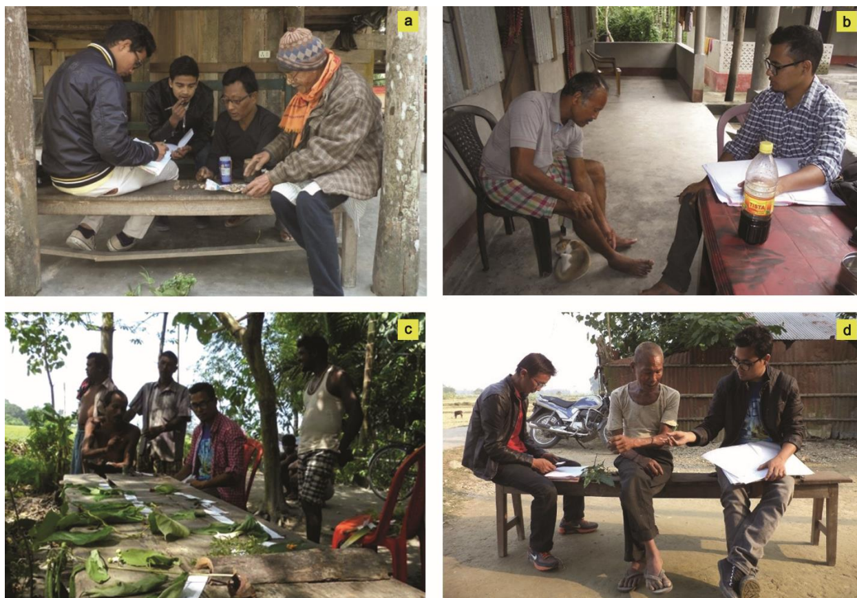
Plate 1— a-d Interaction with respondents during data collection

The schedule was administered to the respondent in local Bengali language and the responses were recorded in English on the schedule. The questionnaire covered aspects like plant species used as ethno-medicines against stomach disorder, plant parts used, procedure for dosage and therapy. The ethno-medicinal plant species were identified mostly in the field with their local names and also by consulting available relevant secondary literature like research papers, book and related websites like researchgate and Google scholar. However the unidentified specimens were mounted on herbarium sheets and cross checked with the available herbarium in the Department of Forestry Uttar Banga Krishi Viswavidyala, Pundibari. The documented plant species were compared with different publications like journals, websites, google scholar, research gate and other available links for cross analysis. The collected data were analysed by using Microsoft Excel.