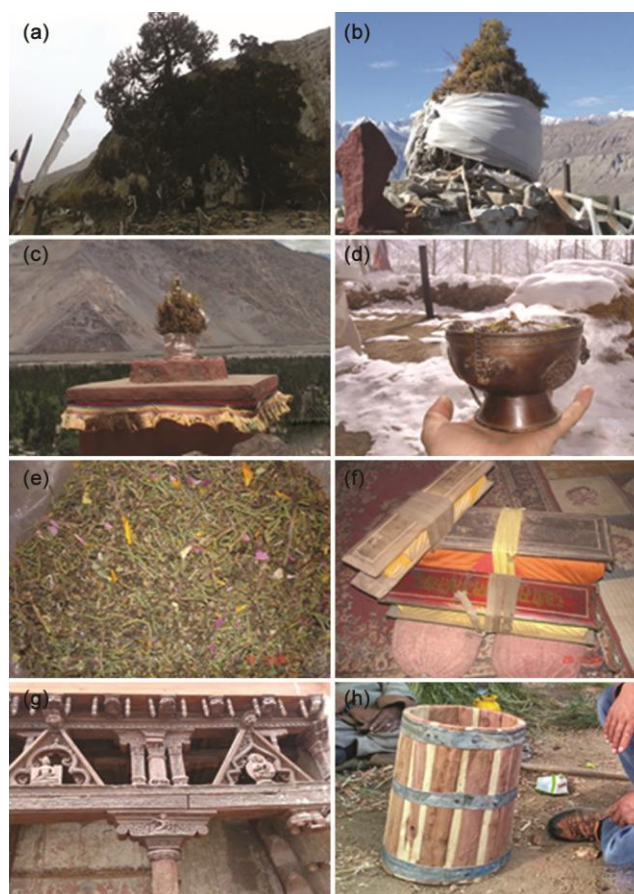
Fig. 3 — Traditional usage of Juniperus polycarpus : (a) A sacred Juniper tree- Lha-chang ; (b and c) Mystical Lha-thos with Juniper twigs; (d) Traditional Phokspor producing juniper aromatic juniper smoke; (e) Green Juniper twigs mixed with other plant materials for incensing; (f) Juniper wood used for Lakshing - wooden cover for Buddhist holy manuscript; (g) Juniper timber used as pillar in Buddhist monasteries; (h) Zem - a container made from Juniper wood.

The cultural heritage and sacredness of J. polycarpus , locally called 'Shukpa', was well depicted in several