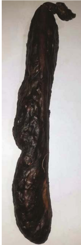
Fig. 2 — Khyopeh , an end product of fermented yak meat inside the rumen of yak.

Staphylococcaceae count ( 10^4 - 10^5 cfu/g) and Enterobacteriaceae count ( <10^4 cfu/g). The pH and moisture content of khyopeh was 5.8 to 6.1 and 1.6-3.5%, respectively. Based on phenotypic characterization (Table 1), Staphylococcus , Escherichia and Enterococcus were tentatively identified. Bacillus cereus was not detected in any sample. ELISA tests were found to be negative for all bacterial toxins tested. Antibiotic sensitivity tests were performed on representative strains of Staphylococcus , Enterococcus and Escherichia (Fig.3). Enterococcus was resistant to six antibiotics, Staphylococcus was resistant to Oxacillin and Escherichia was found to be sensitive to all antibiotics tested except amoxicillin/clavulanate.