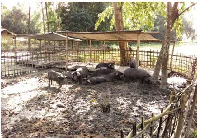
Fig. 2 — Semi-intensive rearing system of pig with roof house and open area

was worked out (Table 2) on the basis of feedstuff availability at farmers door steps. It was observed that rice bran, broken rice, cooked rice, kitchen waste, fermented rice waste and colocasia were the most common feed ingredients fed to pigs of different age. The use of fish meal is occasional. The nutrient