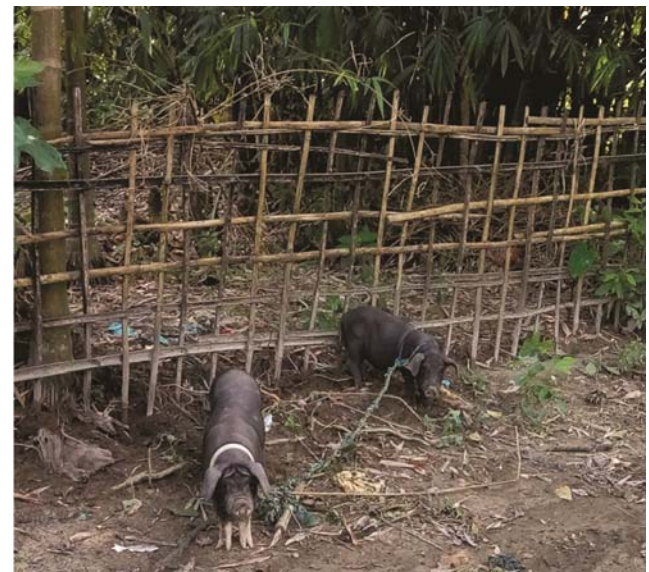
Fig. 4 — Pig reared by tethering system