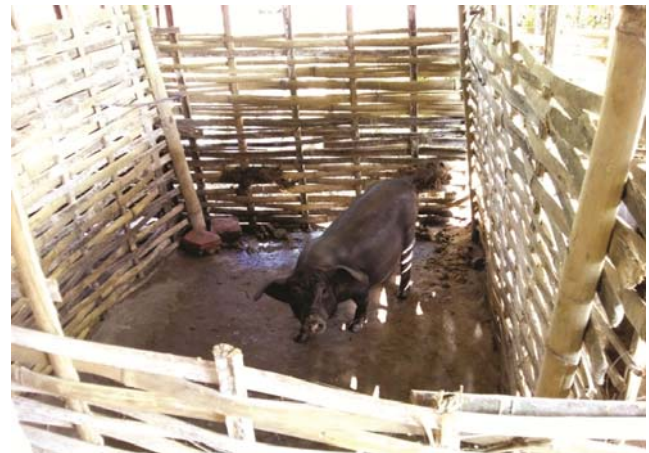
Fig. 3 — Semi-intensive rearing system of pig without roof and open area

was worked out (Table 2) on the basis of feedstuff availability at farmers door steps. It was observed that rice bran, broken rice, cooked rice, kitchen waste, fermented rice waste and colocasia were the most common feed ingredients fed to pigs of different age. The use of fish meal is occasional. The nutrient