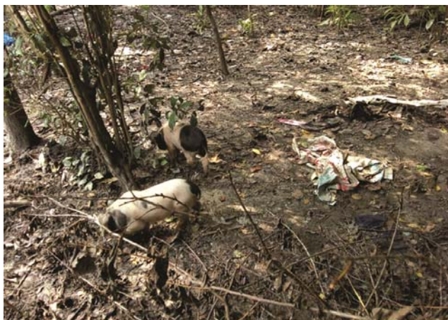
Fig. 5 — Pig reared by scavenging system

Study revealed that the respondents from the area of the study had an average income of rupees two thousand only per month from traditional backyard piggery. Seventy percent of the women farmers (respondents) could generate medium level of income from piggery unit followed by 19.5% who could earn at higher level and 10.50% were able to generate at low level income from their existing backyard piggery unit (Table 5). The previous findings reported lower annual income 12,13 and the higher percentage 14 of annual income from pig farming to total income was reported in Kamrup district of Assam as compared to the present findings. However the involvement of women in backward piggery not considered in earlier reports 11,14 . The haematological values recorded in the present study (Table 6) were lower than the values of healthy pigs.