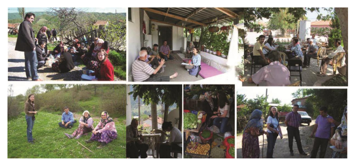
Fig. 2 — Ethnobotanical interviews with local people (at various places)

of the plants used, as well as preparation methods were recorded on Ethnobotanical Information Forms (Supplementary Material 1– Appendix A). The interviews took the form of general conversations and a structured questionnaire. In addition, the plant species collected for sale by villagers in the district markets were recorded.