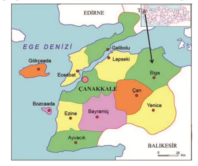
Fig. 1 — Geographical location of the study area.

In this study, in face-to-face interviews with local people, local names, medicinal uses and the parts