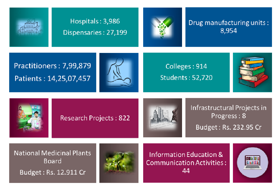
Fig. 1 — AYUSH infrastructure in a nutshell. AYUSH - Ayurveda, Yoga, Unani, Siddha, Homeopathy and Sowa-Rigpa

unfamiliar with the science of Ayurveda but not addressing these has been a stumbling block for Ayurveda. This article addresses some of these concerns in the specific context of COVID-19 and also outlines how Ayurveda can be leveraged to combat the Covid pandemic.