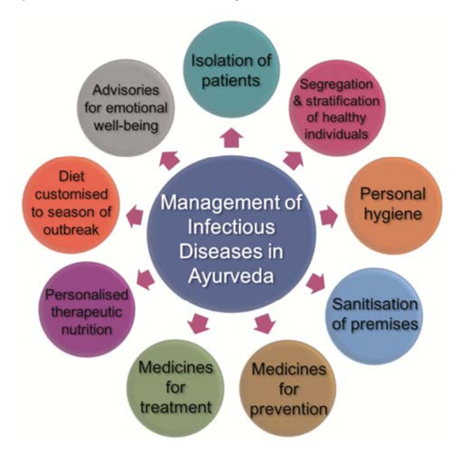
Fig. 2 — Classical management strategy for infectious diseases in Ayurveda

symptoms ( lakshanā ), the location ( sthāna ) and treatment ( chikitsā ). For example, in COVID-19, the signs and symptoms of cough, fever and Acute Respiratory Distress will be considered to be induced predominantly by kapha and vata along with other dosha in uras (chest region) (location). The social and medical conventions to manage infections in Ayurveda are shown in Figure 2. The advisories for