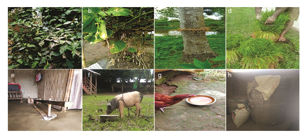
Fig. 3 — ITK's used by the farmers, (a) Application of wood ash, (b) Smoking in cucurbits, (c) Straw wrapped around the tree trunks, (d) Cutting of tips of rice seedling before transplantation, (e) Dheki , (f) Feeding Manimuni ( Centella asiatica ) paste to pigs, (g) Feeding turmeric water to poultry and (h) Sok Ankro.

in Japan and there these straw belts are known as komomaki or waramaki.