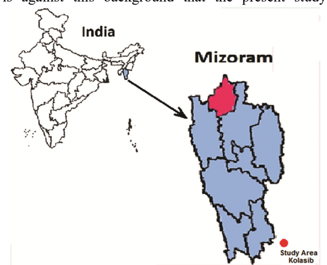
Fig. 1 — Map of Mizoram showing the study area (Kolasib district)

indigenous people are capable of producing their foods by conventionally adopting their ancestral and traditional territorial management practices, they are able to manage their consumption in a sustainable way, thereby substantially avoiding their dependency on external foods, incomes and markets<sup>12</sup>. Indigenous food system knowledge is especially susceptible to socio-economic and ecological disturbances because it is primarily transmitted verbally. The vast majority of indigenous food systems are still largely undocumented, making them even more susceptible to outside disruptions and making them invisible in discussions about the global administration of food systems. Therefore, comprehensive documenting of epistemic resources and their significance for livelihoods and environmental sustainability is required to address the marginalisation of indigenous knowledge in food system transformations<sup>13</sup>. In view of this, the prevailing indigenous food systems are to be well understood, forged, and protected, especially in the context of a changing climate which also is to be key consideration during post-pandemic recovery<sup>14</sup>. It is against this background that the present study