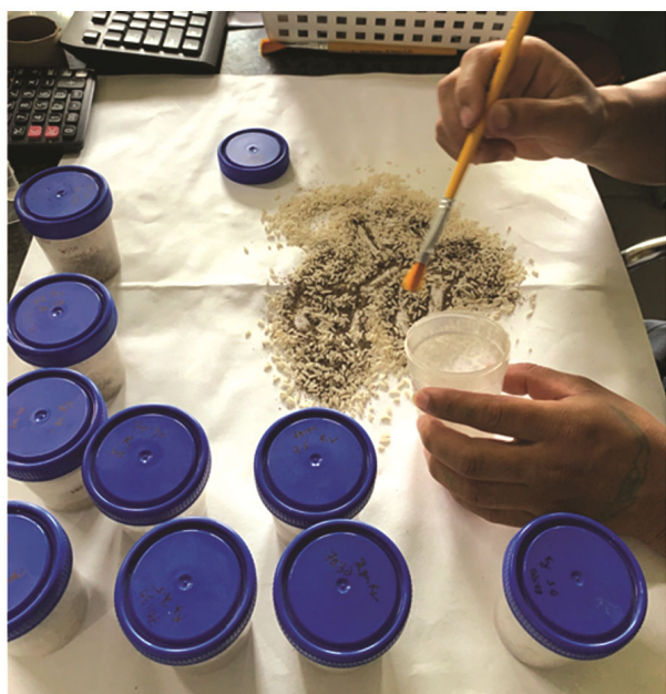
Fig. 2 — Plant powder mixed with rice grain

The growth inhibition in percentage was calculated using the formula given by Tapondjou et al. (2002) 13 :