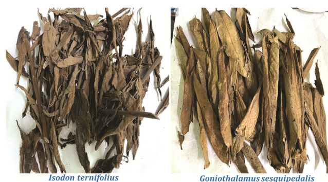
Fig. 1 — Two ethnobotanically important plants used for storage pest management in Manipur

Goniothalamus sesquipedalis and Isodon ternifolius , as shown in Figure 1, are two ethnobotanically important plants used by the farmers in Manipur by burning and smoking in traditional granaries to reduce pests and diseases incidence 8 . These plant components are combined with seeds, suspended in storage rooms, or incinerated to produce smoke prior to stocking a fresh harvest 9 . The Rongmei tribe of Manipur also uses the two plants together in multiple ways. The Rongmeis also drink a mixture of ashes (from the burnt leaves) with water to cure colic pain and stomachache in both children and adults. Konsam et al. (2015) also reported the use of G. sesquipedalis along with Isodon ternifolius in Manipur, one of the states of North-East India, in pre-and post-natal care as well as in traditional fumigation 10 . These plants have been extensively studied and are widely recognized for their usage in the traditional medicine and cultural practices of Northeast Indian communities.