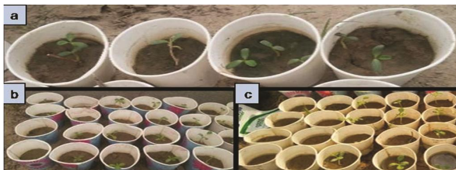
Fig. 3 — Seed treated with AgNP's: Control, (b) from A.niger (c) from A.terreus