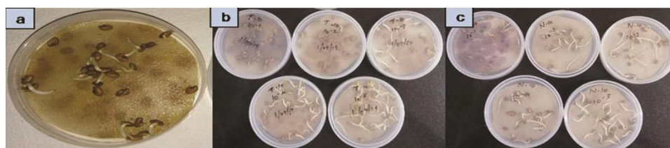
Fig. 2 — Seed treatment with biosynthesized AgNPs: (a) - Control (b) - Seed treated with AgNP's from A. terreus , (c) - Seeds treated with AgNP's from A.niger